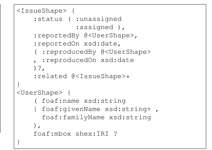
Figure 3: Example of Shape Expressions to validate issues

Figure 4 presents an instance in Turtle syntax that validates against the previous Shape Expressions schema.