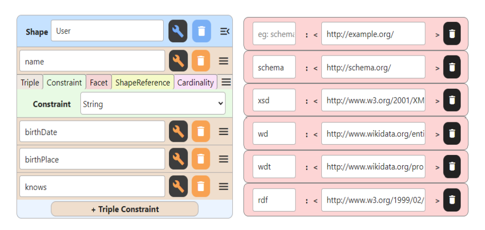
Figure 2. Shape and tiple constraints representation (left) and prefixes representation (right).